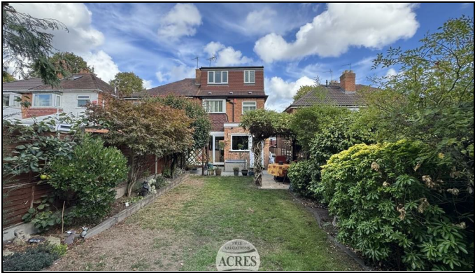
18 Marshall Grove, Birmingham, B44 8HR